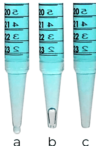
Fig 1. Water column differences. a) A hanging drop will create a higher volume aliquot. b) An air bubble will create a lower volume aliquot. c) An ideal situation with neither a hanging drop nor an air bubble.