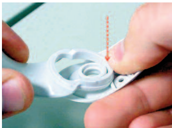
Figure 4: Side view of initial alignment