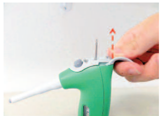
Figure 3: Hook and top cover Removal