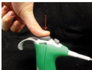
Figure 7: Plunger button reattachment