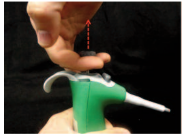
Figure 1: Button removal