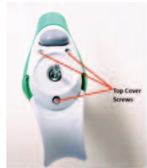
Figure 2: Top cover screws