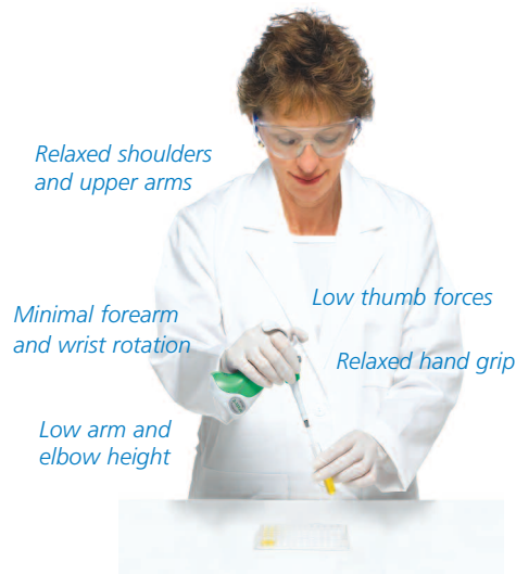
Ovation's "low profile" also allows better visibility for acquiring tips, and guiding tips into small vessels such as microtubes.

Ovation is a whole new class of pipette – not an old design with minor improvements. Its innovative shape naturally follows the contours of the palm, and allows all pipetting steps to be performed with neutral postures, minimal muscular movements, and low hand and arm elevations. Best of all, Ovation is the most comfortable, easy-to-use pipette you will ever experience!