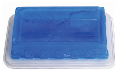
100mL Reagent Reservoir Cooler