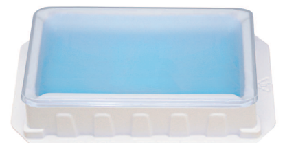
100mL Reagent Reservoir with Lid