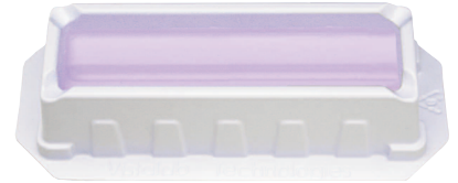
25mL Reagent Reservoir