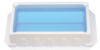
100mL Reagent Reservoir