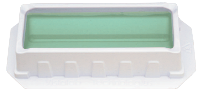
50mL Reagent Reservoir