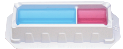
25mL Divided Reagent Reservoir