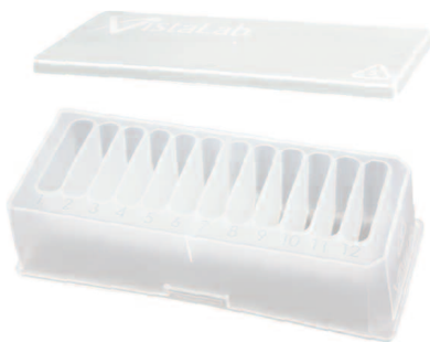
12 Channel Reservoir with Lid (Autoclavable)