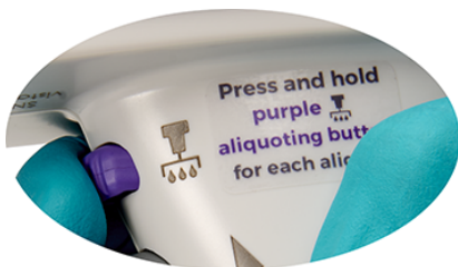
• aliquot button