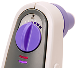
• aliquot speed dial

New! Variable aliquot Speed (VS) model now available