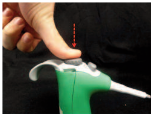
Figure 3: Plunger Button Reattachment