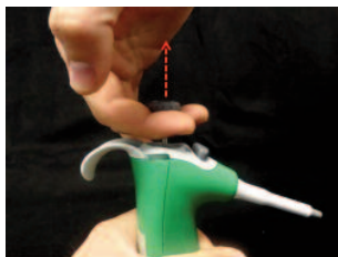
Figure 1: Button Removal